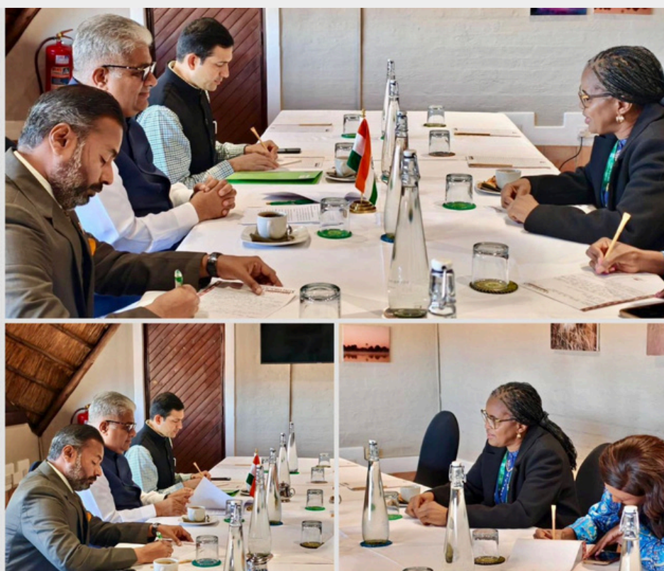
Union Minister Shri Bhupendra Yadav with Ms Indileni Daniel, Minister of Environment, Forestry and Tourism, Namibia, in Zimbabwe on 25 th July 2025