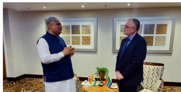
Shri Bhupender Yadav held a meeting with Dr. Dion George, Minister of Forestry, Fisheries and the Environment of the Republic of South Africa on 25 July 2025

Shri Bhupender Yadav emphasized India's pioneering role in establishing the India-Big Cat Alliance (IBCA), aimed at enhancing the protection and conservation of big cats across range countries. The initiative has received an encouraging response from partner nations, opening up possibilities for joint conservation programs, knowledge exchange, and sustainable management of critical habitats, further strengthening India-South Africa ties in wildlife protection.