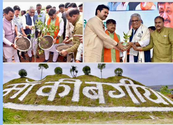
Union Minister Shri Bhupendra Yadav at the ‘Maa Ki Bagiya’ plantation on 12 th July at Revati Range along Ujjain Road, MP

The plantation in “Maa ki Bagiya” was successfully completed, coinciding with the anniversary of last year’s world record plantation. Participants took joy in seeing the saplings they planted growing and blossoming, reflecting the country’s commitment to a greener future.