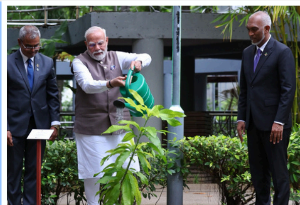
Prime Minister Shri Narendra Modi and the President of the Republic of Maldives, H.E. Dr. Mohamed Muizzu, jointly planted saplings in Malé on 25 July 2025

Prime Minister Shri Narendra Modi and the President of the Republic of Maldives, H.E. Dr. Mohamed Muizzu, jointly planted saplings in Malé on the 25 th of July, reaffirming the shared commitment of both nations towards sustainability and climate action. The symbolic gesture gave further momentum to MOEF&CC's Ek Ped Maa Ke Naam campaign. It also resonated with Maldives' pledge to plant 5 million trees, underlining the importance of regional cooperation in advancing environmental stewardship.