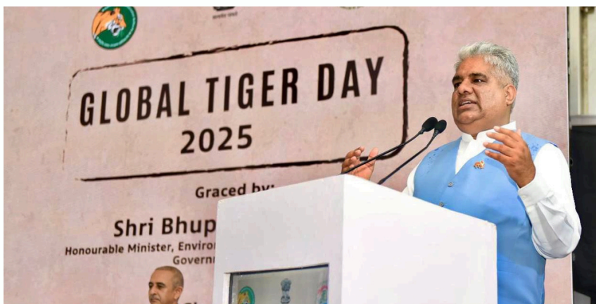
Union Minister Shri Bhupendra Yadav addressing the audience on Global Tiger Day 2025 at the Zoological Park, New Delhi on the 29 th of July.

The Ministry of Environment, Forest and Climate Change (MoEF&CC) celebrated International Tiger Day on 29 th July 2025 with a series of events underscoring India's leadership in wildlife protection and ecological sustainability.