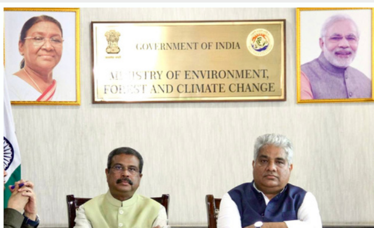
Union Ministers Shri Bhupendra Yadav and Shri Dharmendra Pradhan at MoEF&CC on the 17 th of July 2025 to discuss the institutionalization of Mission LiFE in school education

The discussion highlighted the growing environmental consciousness among India's youth and emphasized that under the National Education Policy (NEP) 2020, environmental learning is a core element of school education. Shri Bhupendra Yadav underlined that PM Modi's vision of making environmental conservation a Janbhagidari (people's movement) can best be realized by engaging students early and fostering sustainable lifestyles through education.