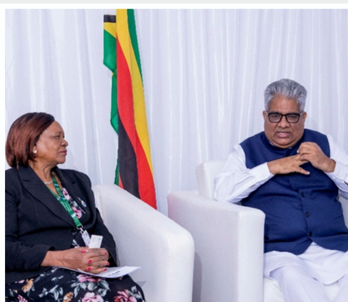
Union Environment Minister Shri Bhupender Yadav meets Dr Evelyn Ndllovu, Minister of Environment, Climate and Wildlife, Republic of Zimbabwe on sidelines of COP15 summit in Zimbabwe on the 25 th of July 2025