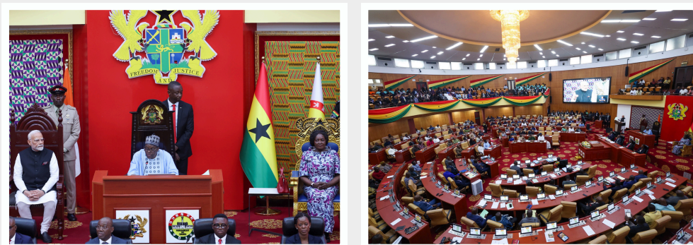
PM Shri Narendra Modi addressing the Parliament of Ghana on 3 rd July 2025

While addressing the Parliament of the Republic of Ghana on the 3 rd of July 2025, PM Shri Narendra Modi highlighted India’s firm commitment to tackling climate change and promoting sustainable living through Mission LIFE – Lifestyle for Environment. He emphasized that this initiative encourages individuals and communities to adopt environmentally responsible lifestyles, forming the foundation of India’s broader climate action strategy. He also underscored India’s role in advancing global sustainability through collaborative initiatives such as One World, One Sun, One Grid to expand renewable energy access; One World, One Health to promote planetary health; the International Solar Alliance to encourage solar energy adoption; the International Biodiversity Conservation Alliance to protect wildlife; and the Global Biofuels Alliance to promote clean biofuels and reduce carbon emissions.