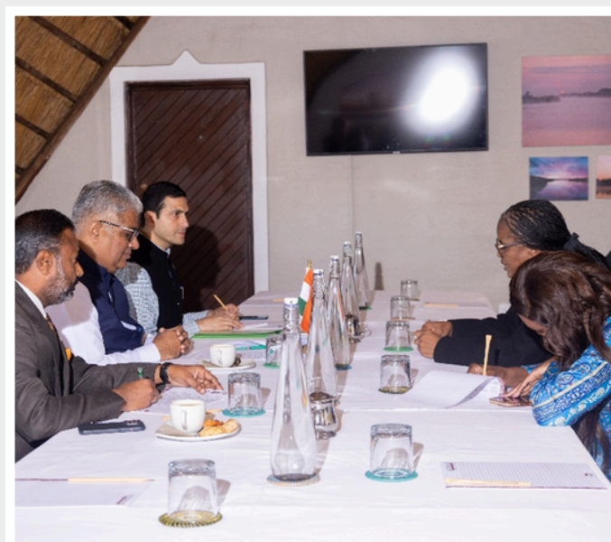
Union Environment Minister Shri Bhupender Yadav meets Honourable Indileni Daniel, Minister of Environment, Forestry and Tourism, Republic of Namibia on sidelines of COP15 summit in Zimbabwe on the 25 th July 2025