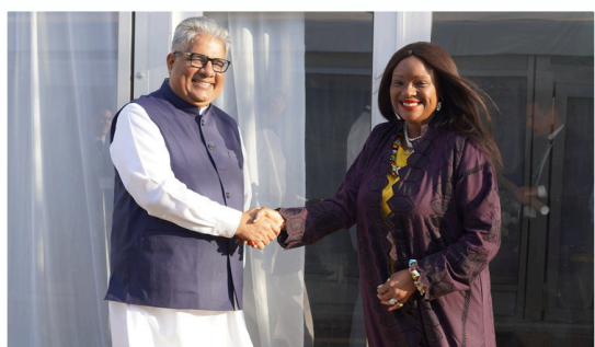
Union Minister Shri Bhupender Yadav meets Ramsar Secretary General Dr Musonda Mumba on sidelines of COP15 summit

Union Minister Shri Bhupender Yadav, visited Zimbabwe where he met the Secretary General of the Convention on Wetlands, Dr Musanda Mumba on the 25 th of July 2025. The discussions focused on the conservation and sustainable management of wetlands, recognizing their critical role in biodiversity, climate resilience, and community livelihoods. The meeting reaffirmed India's commitment to the Ramsar Convention and highlighted the country's progress in designating Ramsar sites and promoting community-led wetland management.