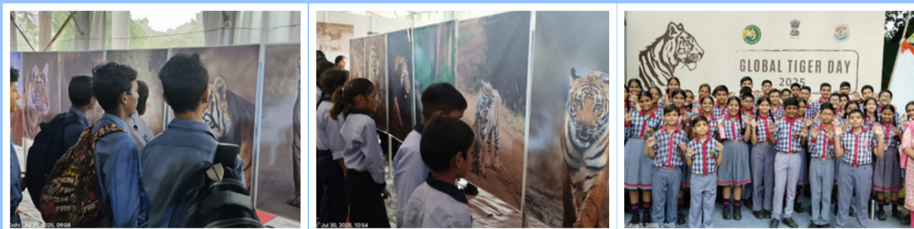
Students participating at the Global Tiger Day celebration on 29 th July 2025

NMNH partnered with the National Tiger Conservation Authority (NTCA) to celebrate Global Tiger Day 2025 at the National Zoological Park, New Delhi. More than 250 students participated in an exhibition on “Harmonious Coexistence between Humans and Tigers” in the presence of dignitaries and senior officials. A week-long series of activities that followed engaged over 2,000 students and teachers from 27 schools through tiger enclosure visits, clay modeling, painting, quizzes, and mask-making. Together, these initiatives highlight NMNH’s commitment to nurturing young conservation leaders and reinforcing India’s message of biodiversity protection and sustainable coexistence with wildlife.