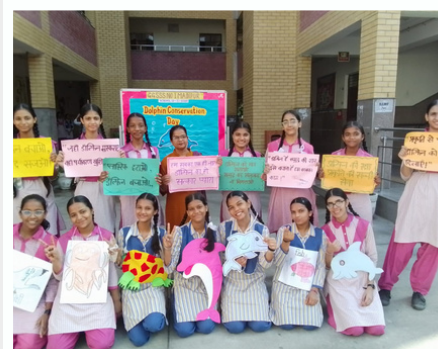
Students participating at the “Our Dolphin – Our Heritage,” campaign to build awareness on river and marine dolphin conservation.