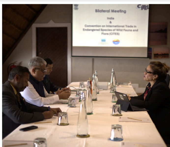
Union Environment Minister Shri Bhupender Yadav meets CITES Secretary-General Ms. Ivonne Higuero on sidelines of COP15 summit in Zimbabwe on the 25 th of July 2025