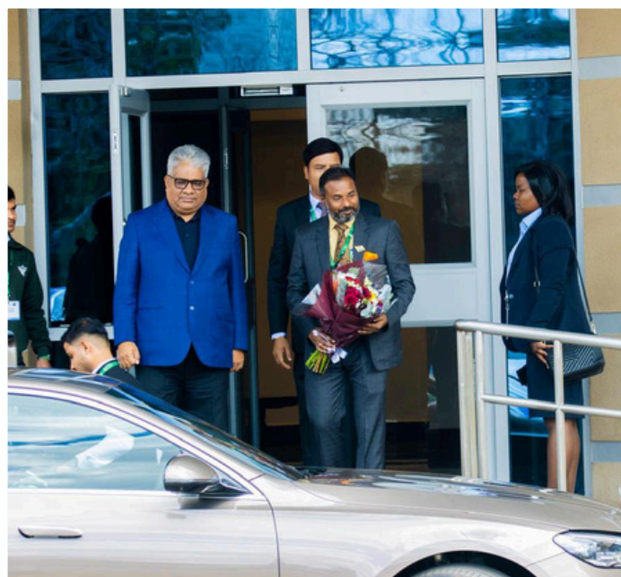
Union Minister Shri Bhupendra Yadav arrived at Victoria Falls, Zimbabwe on the 23 rd of July to participate in Ramsar COP15