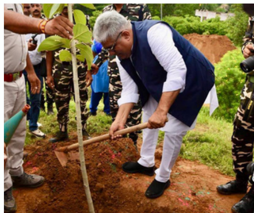
Union Minister Shri Bhupendra Yadav at inauguration of the Hariyalo Rajasthan plantation program at Kati Ghat, Alwar on the 27 th of July 2025