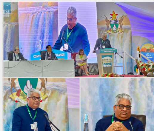
Union Minister Shri Bhupendra Yadav addressed the High-Level Ministerial Segment at Ramsar CoP 15 in Victoria Falls, Zimbabwe, on 24 th July 2025

At the 15th Ramsar Conference of the Parties (CoP15) in Victoria Falls, Zimbabwe, India's resolution on "Promoting Sustainable Lifestyles for the Wise Use of Wetlands" was unanimously adopted on 30 July 2025, with support from 172 Contracting Parties and six international partners. The resolution highlights the role of individual and societal choices in wetlands conservation and encourages a whole-of-society approach, integrating sustainable lifestyles into wetland management, programmes, and investments, along with public-private collaboration, education, and awareness initiatives. Sustainable lifestyles, as defined in the resolution, are ways of living that reduce environmental impact, support equitable socio-economic development, and enhance quality of life through better health, well-being, and social relationships. Union Minister Shri Bhupendra Yadav emphasized their importance in fostering pro-planet behaviour and invited global support, linking the resolution to earlier frameworks like UNEA Resolution 6/8 (2024) on promoting sustainable lifestyles. India has embedded these principles into national wetlands efforts through Mission LiFE, Mission Sahbhagita, and the Save Wetlands Campaign, mobilizing over 2 million volunteers to map 170,000+ wetlands and demarcate 120,000 boundaries in three years. The resolution reinforces India's leadership in connecting sustainable lifestyles with effective wetlands conservation globally.