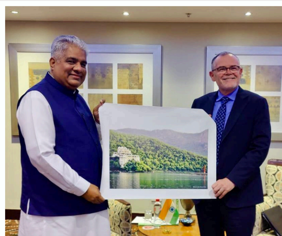
Shri Bhupender Yadav held a meeting with Dr. Dion George, Minister of Forestry, Fisheries and the Environment of the Republic of South Africa

Shri Bhupender Yadav held a meeting with Dr. Dion George, Minister of Forestry, Fisheries and the Environment of the Republic of South Africa on the 25 th of July to explore avenues for deepening bilateral cooperation on environmental sustainability. The discussions focused on sustainable lifestyles, wildlife conservation, and safeguarding the livelihoods of indigenous communities. The dialogue highlight the significant contributions of Indian institutions such as the Wildlife Institute of India (WII), Botanical Survey of India (BSI), and Indian Council of Forestry Research and Education (ICFRE) in advancing research, training, and capacity building for wildlife and biodiversity protection.